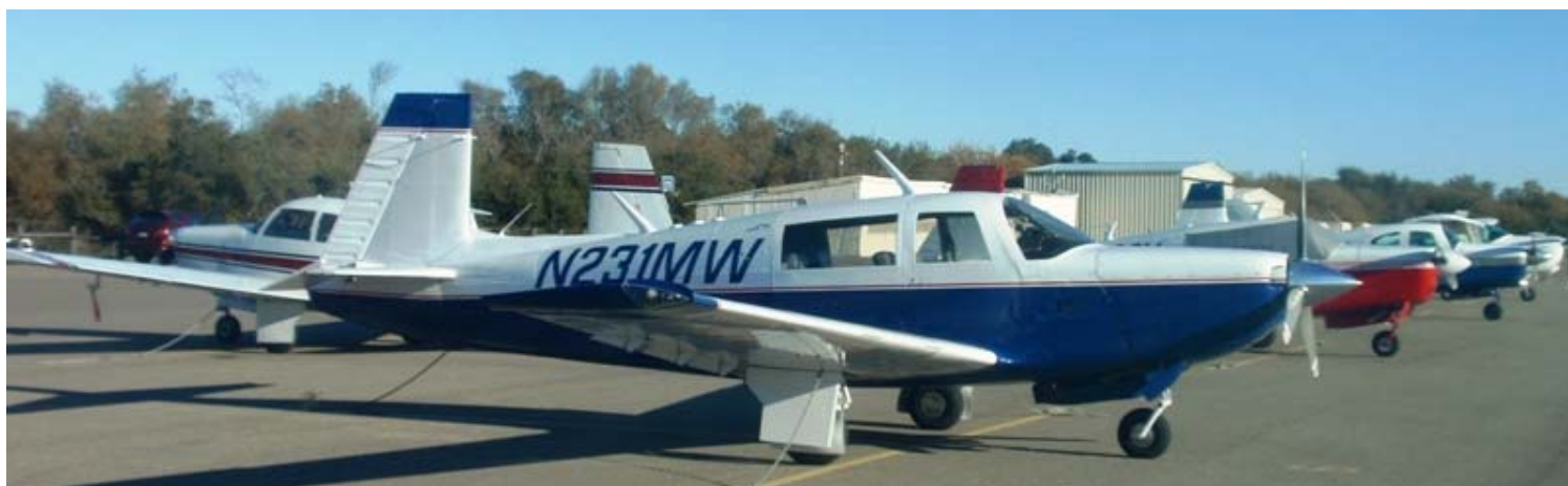
I took a quick glance at some sleek Mooneys on the taxi out for take off to Corona