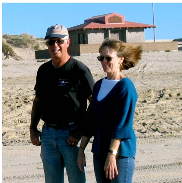
I did a high speed pass southbound after the 270 and we dried Linda's hair