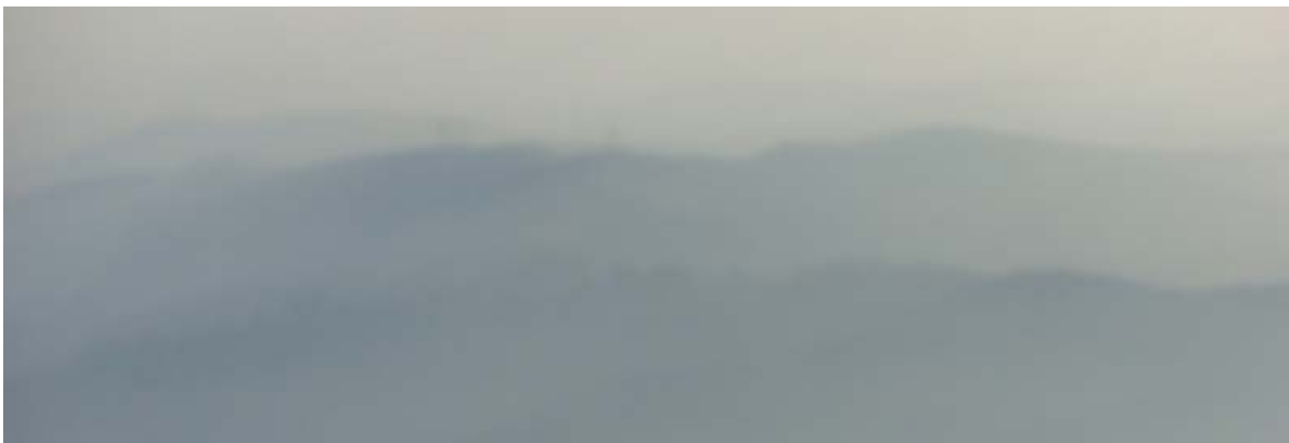
And real HAZE around downtown LA