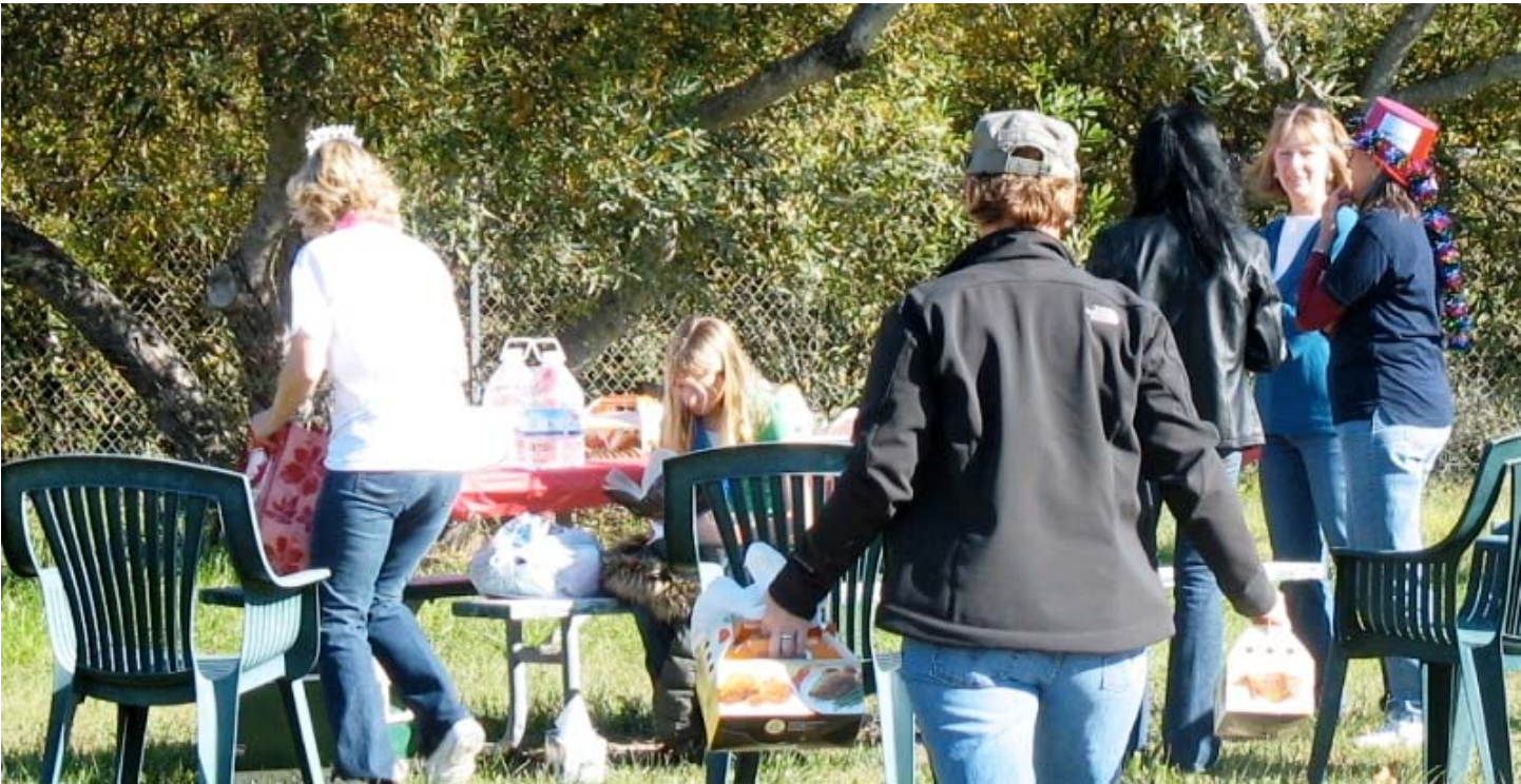
A wise crack about nice buns for lunch would not be in VMG good taste