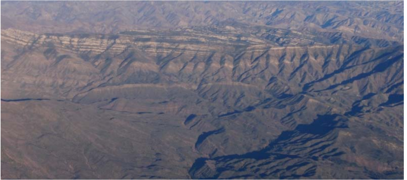
More neat scenery on the way home