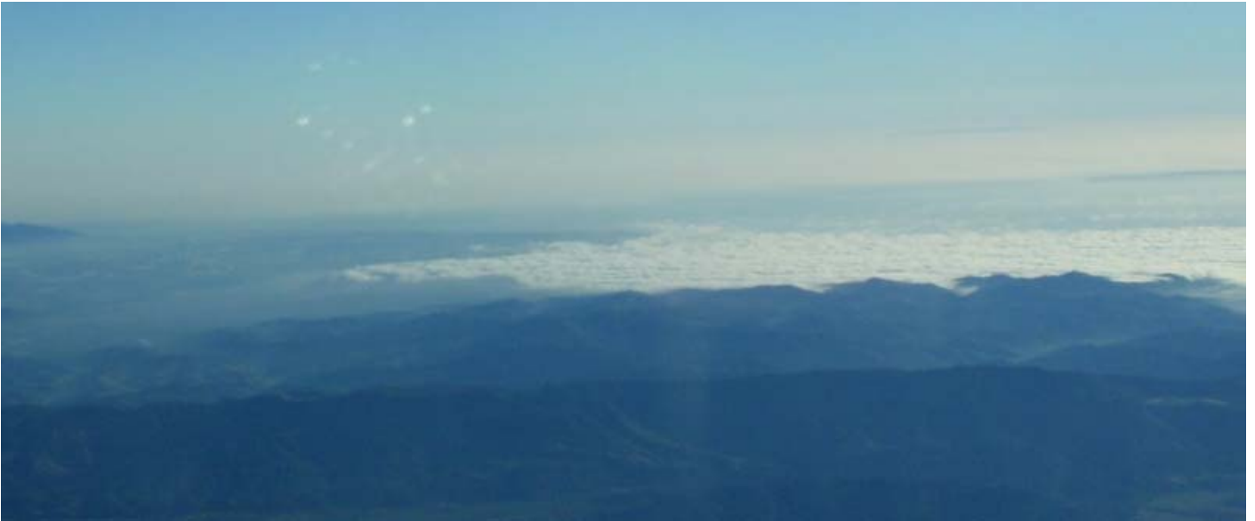
Contrasted by low overcast clouds over by Santa Barbara